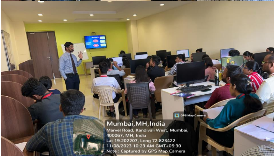
Mumbai, MH, India Marvel Road, Kandivali West, Mumbai, 400067, MH, India Lat 19.202207, Long 72.823422 11/08/2023 10:23 AM GMT+05:30 Note : Captured by GPS Map Camera