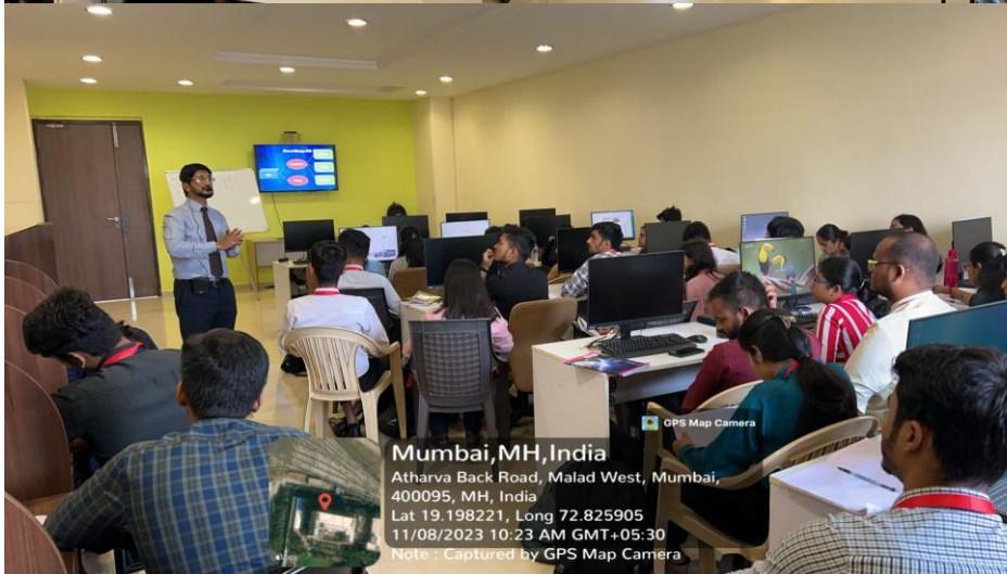
Mumbai, MH, India Atharva Back Road, Malad West, Mumbai, 400095, MH, India Lat 19.198221, Long 72.825905 11/08/2023 10:23 AM GMT+05:30 Note : Captured by GPS Map Camera