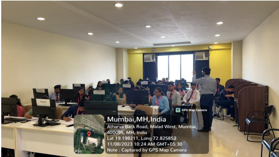
Mumbai, MH, India Atharva Back Road, Malad West, Mumbai, 400095, MH, India Lat 19.198211, Long 72.825852 11/08/2023 10:24 AM GMT+05:30 Note : Captured by GPS Map Camera